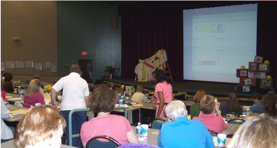
The Macon ETTC provided a wonderful venue for the Summer Institute.